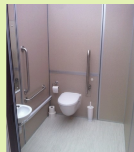
FlexilooSmart™ set up at Bleinheim Palace for the Game Fair

Flexiloo will again be exhibiting at the Showman's Show in October and we are excited to display our new products. We'll be in our usual place in Avenue D so make sure you come to visit us.